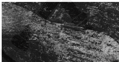
After Geiger 1956, pl. XLIV