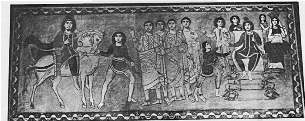
Purim panel, after Gutman 1992

More important is the following inscription (Geiger 1956: no. 44) which is placed on the panel scene associated with the story of Purim: